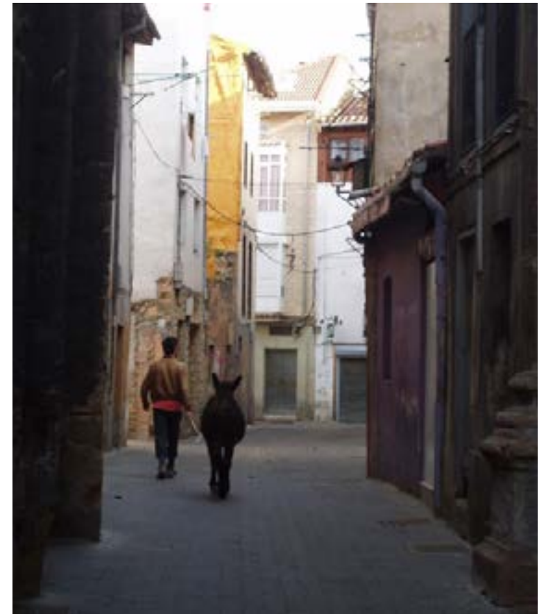
Riding Tikki, 2005 Miranda de Ebro 2005

Ambulation with a donkey in Castilian city which served as a concentration camp for the International Brigades in the Francoist dictatorship. This animal has gradually disappeared from the region, having served the dirty work of the Spanish Civil War.