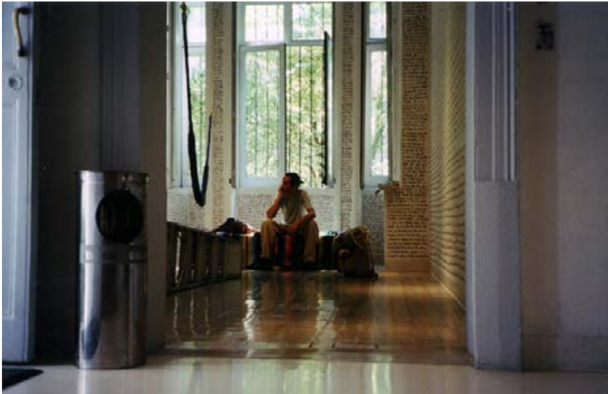
Habitacion uno, 2003

Be hosted in a gallery. Writing a logbook on the walls.