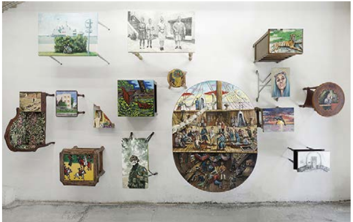
FRANCHE TOUCHE, 2018 Installation, paintings, furniture Bruit de Fond - Marseille 2018